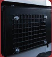
High Output Day Heater