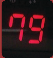
Single Water Tank With Digital Thermostat