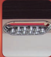
LED Lighting With Manual Override