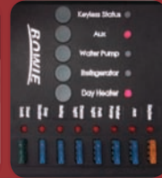
Electronic Smart Panel